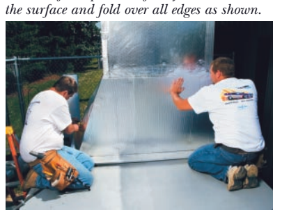
pressure to the entire surface with a hand roller.