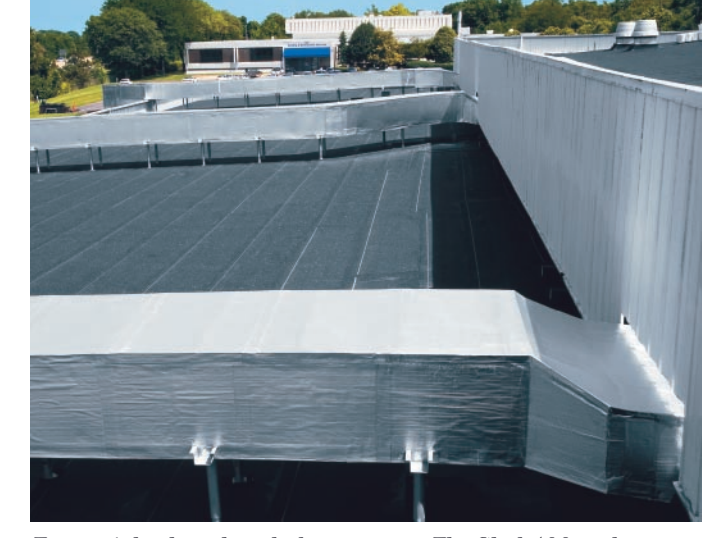
For straight, long length duct systems, FlexClad-400 makes for a clean, uncluttered appearance. Quickly and easily installed, it replaces expensive and cumbersome metal jacketing commonly used to protect insulated ductwork.

FlexClad-400 by MFM. What could be easier?