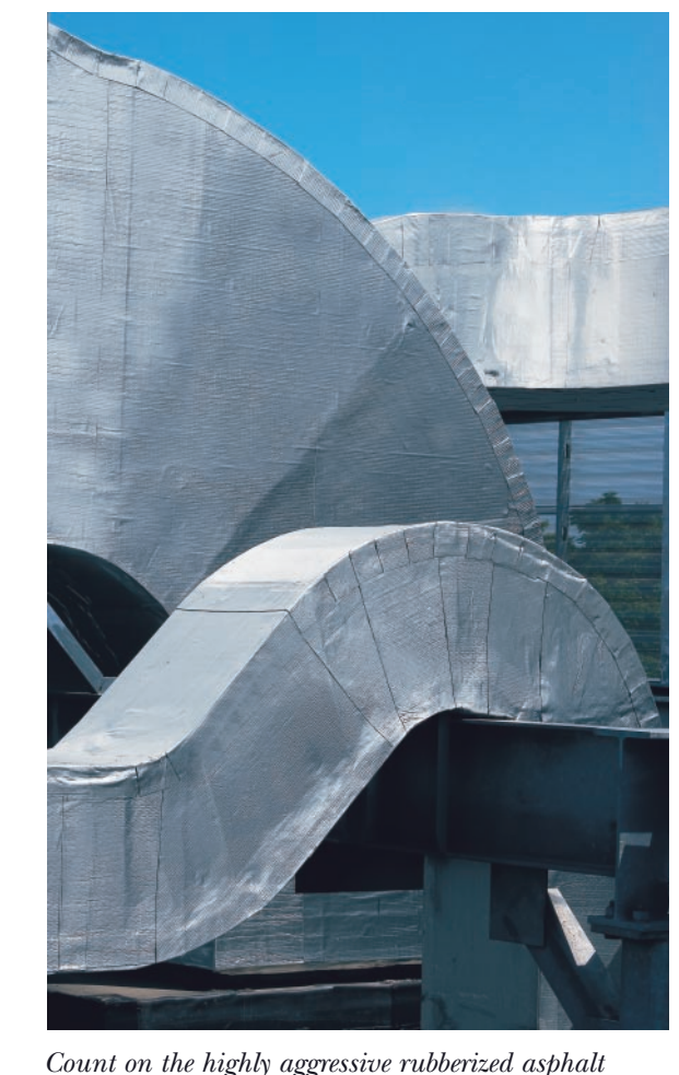
adhesive on FlexClad-400 to securely stick to rigid board insulation protecting it from weather damage and deterioration. Note: On installations involving curved shapes and edges, metal angle should be used to prevent corners of the insulation material from deforming and to give a neat, finished look.