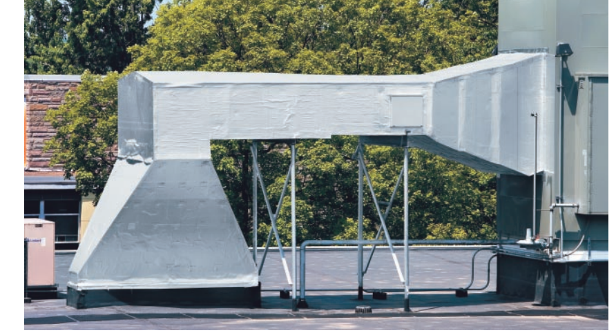
Unlike competitor products, the 40 mil thickness of FlexClad-400 provides excellent weather and self-sealing protection without the excess weight of unnecessary "filler" materials in its composition.