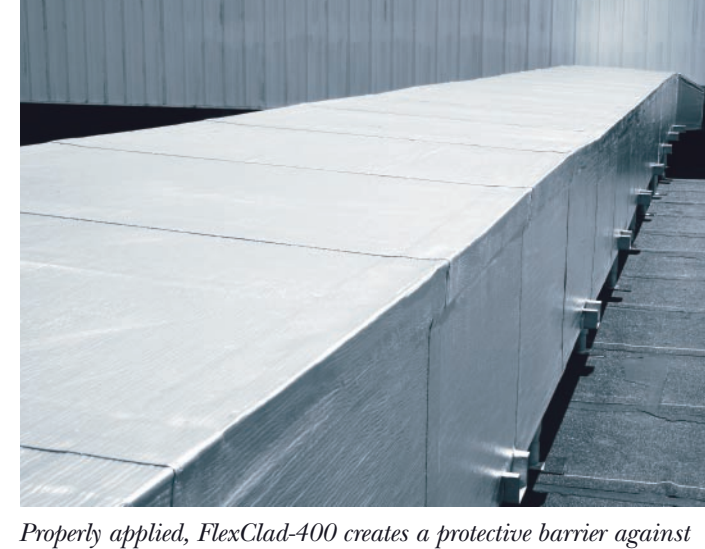
inclement weather, and the UV-resistant aluminum top surface reflects sunlight to reduce interior temperatures... and energy costs. Durable, protective and self-sealing around punctures, it conforms to and effectively seals around external support brackets.