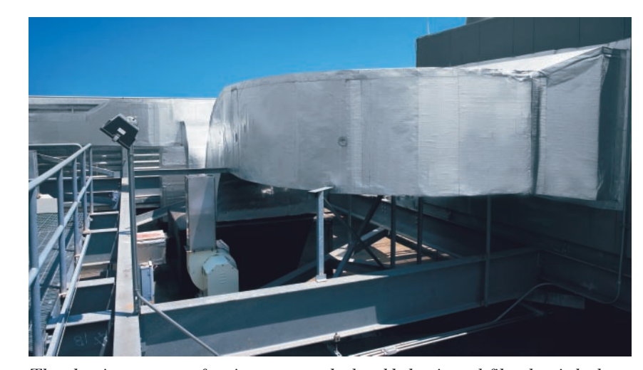
The aluminum top surface is an extremely durable laminated film that is both highly tear- and puncture-resistant. FlexClad-400 is also available in four different color choices in order to allow you to blend your system to the surrounding structure.