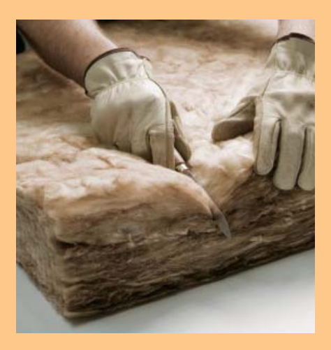
EcoBatt insulation ensures the professional touch —consistent quality, low dust and easy to cut handling characteristics that you've come to expect from Knauf.

EcoBatt Insulation is naturally brown assures no phenol, formaldehyde, acrylics or artificial colors are used in the manufacturing process.