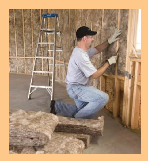
Knauf manufactures a full line of EcoBatt insulation—a variety of widths, R-values, densities and facings.