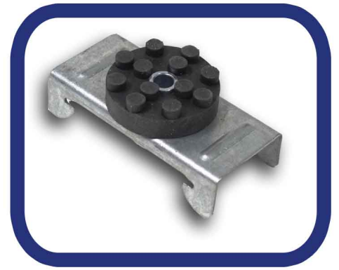
MetroFlex Resilient Sound Isolation Clip

Metro Supply Company distributes MetroFlex Resilient Sound Isolation Clips which are designed to decouple drywall from a wall or ceiling structure. MetroFlex RSIC clips are easy to install by simply being screwed to existing wood or steel studs/joists. Resilient Channel is held in to place by clips spread no more than 48" apart. Drywall is then installed on top of the Resilient Channel by simply being screwed into the channel strips. MetroFlex Resilient Sound Isolation Clips can reduce noise transfer from between 75% to 100%. MetroFlex RSIC Clips have been tested to be part of assemblies that have STC Ratings of up to 64 !