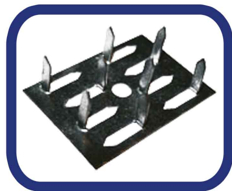
MetroFlex Acoustic Panel Impaling Clip

MetroFlex Acoustic Panel Impaling Clips are designed to make fastening Acoustic Panels to walls fast and easy. MetroFlex Impaling Clips are made of galvanized steel and contain 8 impaler spikes per clip. The impaling clips are designed to work with both Fiberglass and Mineral Fiber Panels with densities from 3# up to 8# (per cubic foot).