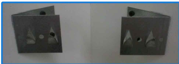
MetroFlex Bass Trap Corner Brackets Installed In Corner

TO ORDER CALL: 888-75-METRO www.Metro-Supply-Co.com