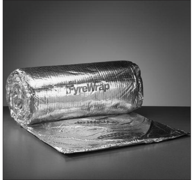
FyreWrap 0.5 Plenum Insulation

Core Material: FyreWrap 0.5 Plenum Insulation incorporates Insulfrax® Thermal Insulation as its core material. Insulfrax is a high-temperature insulation made from a calcia, magnesia, silica chemistry designed to enhance biosolubility. It provides excellent insulation in a noncombustible blanket product form.