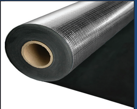
MetroFlex Foil Faced Mass Loaded Vinyl

MetroFlex FF Mass Loaded Vinyl Sound Barrier will not shrink, rot, or cause metal corrosion, and also features a strong resistance to adverse environmental conditions, oils, weak acids, and alkalis. MetroFlex FF MLV is used primarily on soundproofing HVAC ducts, piping, machinery, and exhausts. FF MLV is ideal for direct application to the noise source and/or to the housing covering the noise source.